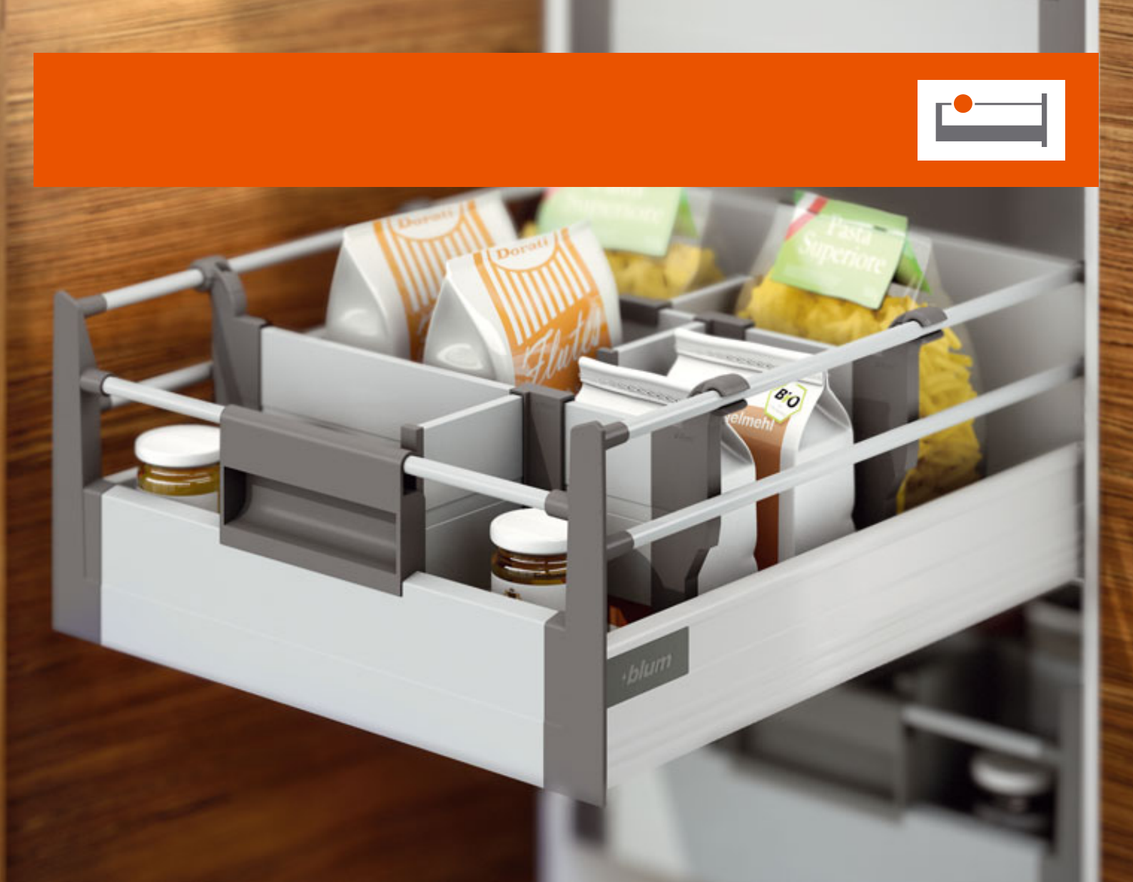
Inner pull-out with double gallery.