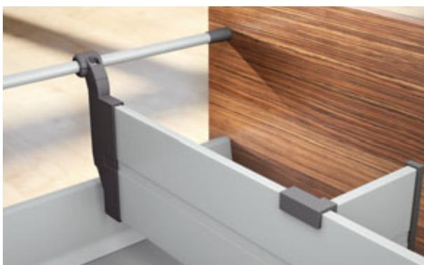
ORGA-LINE longside and cross dividers organise interiors. The ORGA-LINE connecting components for TANDEMBOX plus are dust grey.