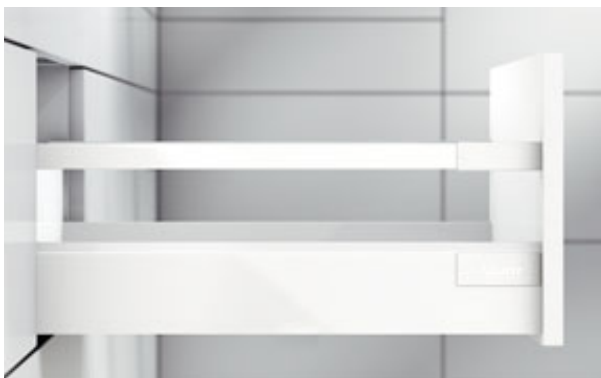
Characteristic: The square gallery

TANDEMBOX antaro is available in silk white, stainless steel, white aluminium (RAL 9006) and terra black.