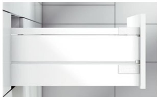
Enclosed drawer with metal design elements