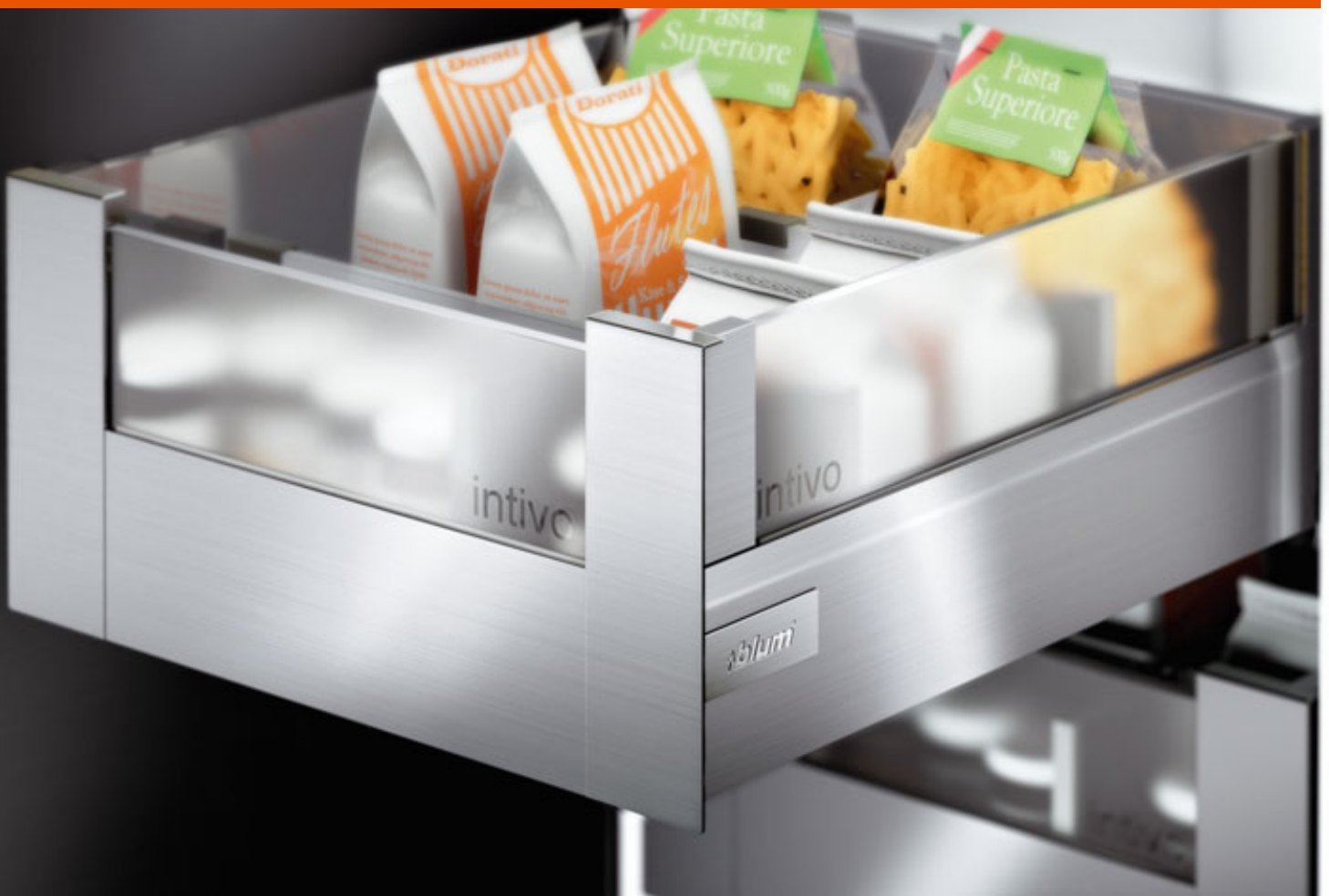
Inner pull-out with glass design elements by Blum.