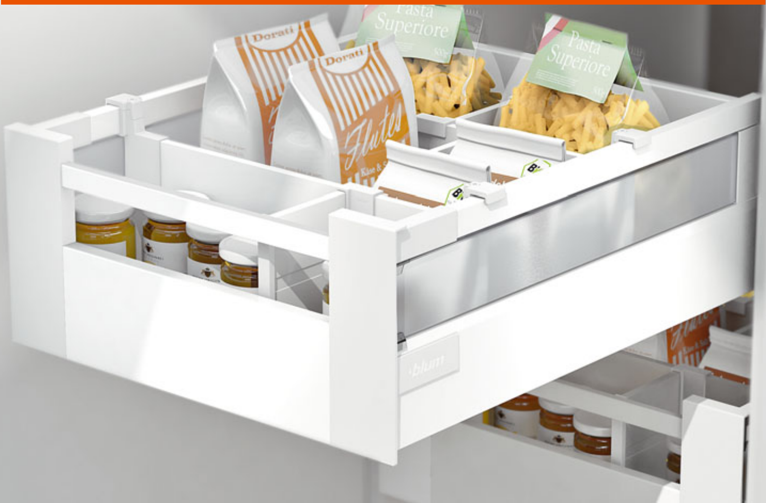
Inner pull-out with gallery and frosted glass design elements by Blum.