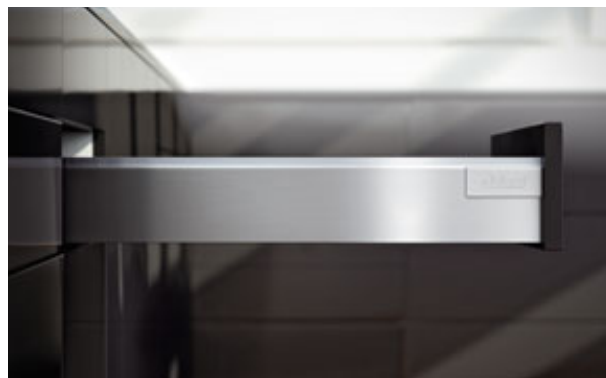
A matching drawer is available with TANDEMBOX intivo.