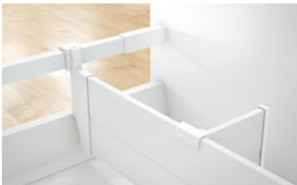
All components are colour coordinated: ORGA-LINE for TANDEMBOX antaro. The colour of the nylon parts matches that of the drawer side.