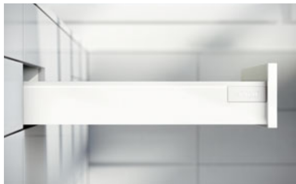
There is a matching drawer to go with TANDEMBOX antaro.