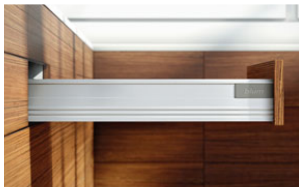
Matching drawers complete the TANDEMBOX plus line.