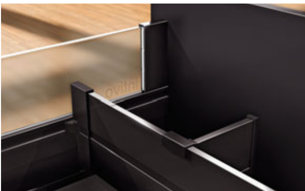
The design and colour of ORGA-LINE have been coordinated with TANDEMBOX intivo. The colour of nylon parts matches that of drawer sides.